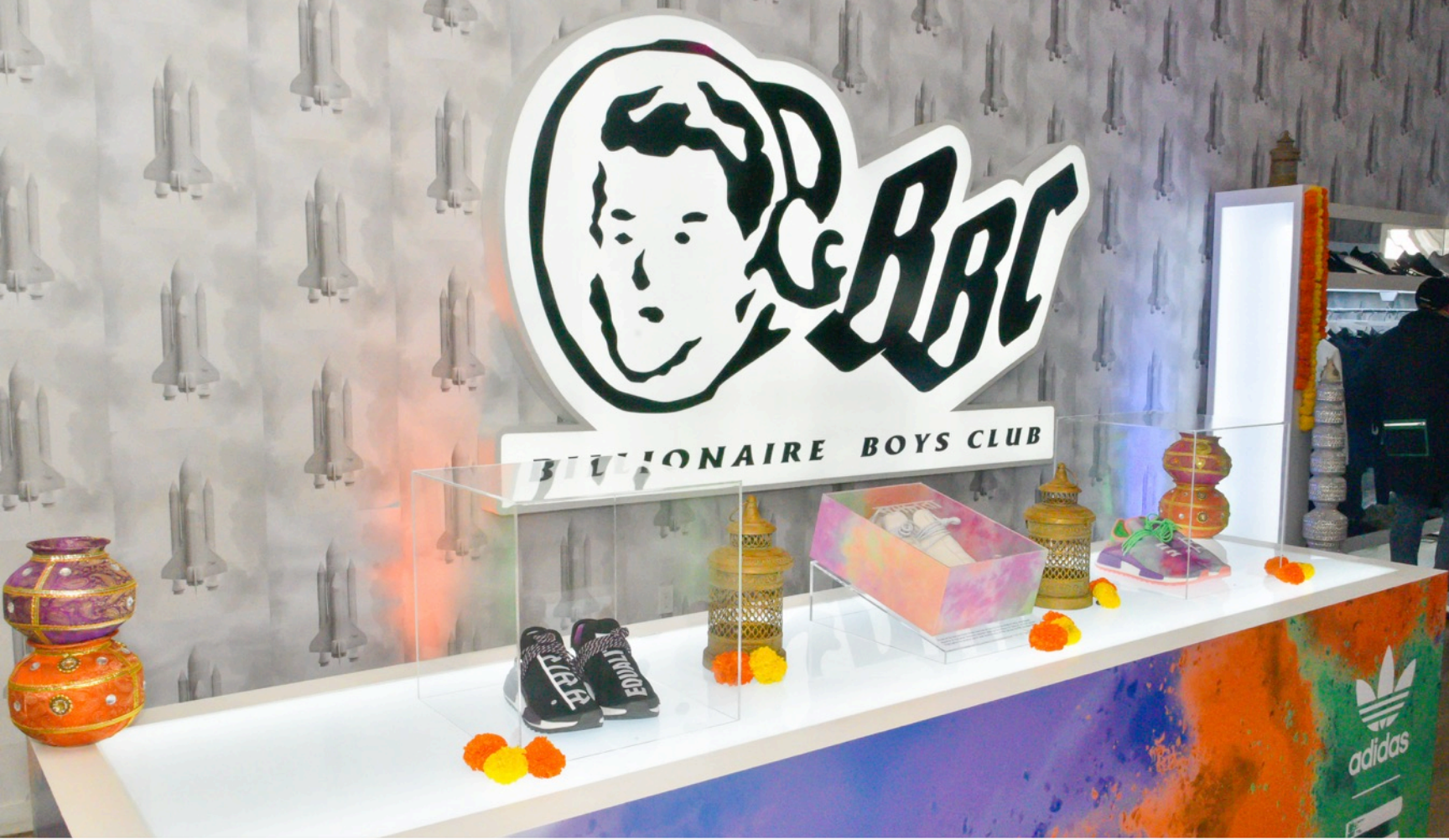
BBC'S FLAGSHIP STORE WITH HOLI DÉCOR + LAUNCH PRODUCT