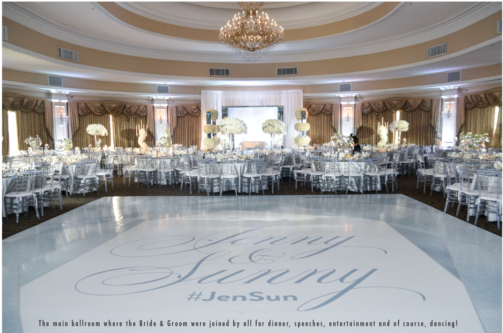
The main ballroom where the Bride & Groom were joined by all for dinner, speeches, entertainment and of course, dancing!